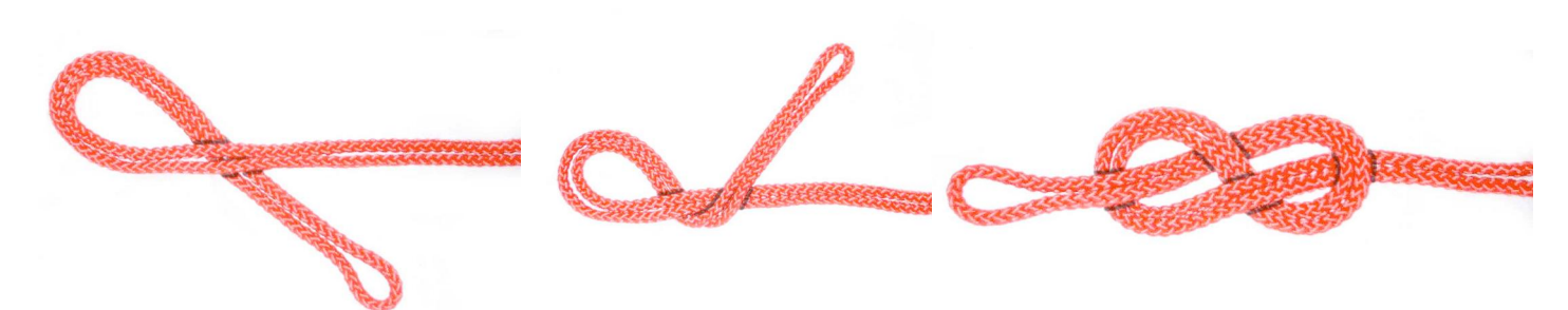
Figure 8 Knot

1 - Loop the centre of the rope under the tails