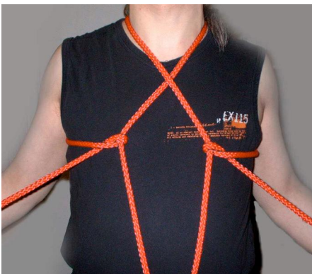
3 - Loop tail upwards over central rope, then down and under itself