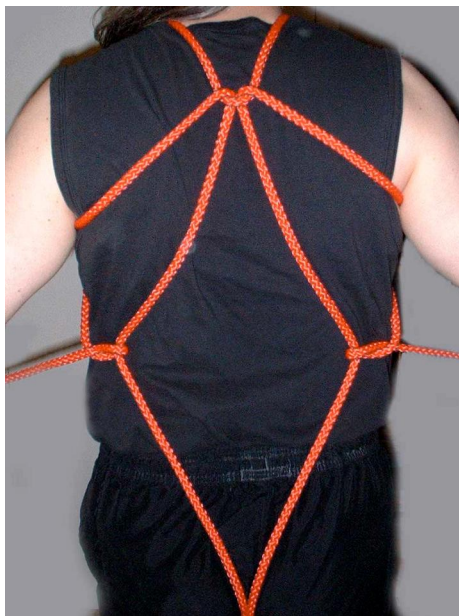
4 - Repeat process at back of harness