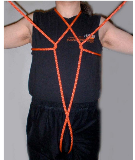
3 - Cross left tail under right central rope and vice versa