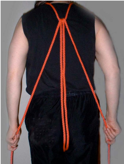
1 - Start with Larks Head Knot loosely around body